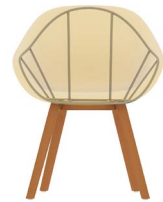
4-Legs small chair