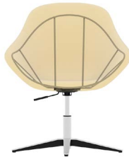
Big swivel chair

Inner structure: Ø 10 mm steel rod welded to metal plates.