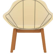
4-Legs big chair