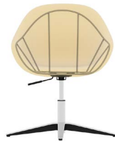
Small swivel chair